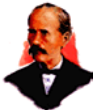
Antonio de Torres

From the mid 19 century to the present, the guitar has grown in popularity throughout the world. The guitar is capable of expressing the music of all cultures. In the 20th century, there have been many new developments such as steel string guitars, amplified guitar, solid body guitar and guitar of many shapes. Today, we will investigate some of the many types and styles of guitar: classical, jazz, blues, Latin, flamenco, electric, and pop .